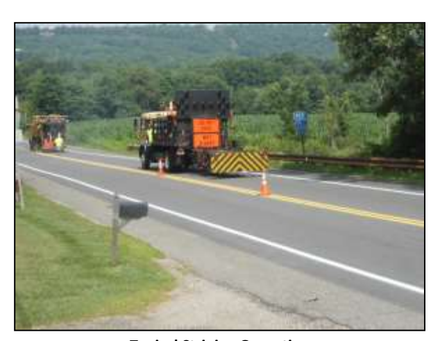
Typical Striping Operation