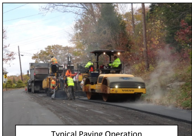
Typical Paving Operation