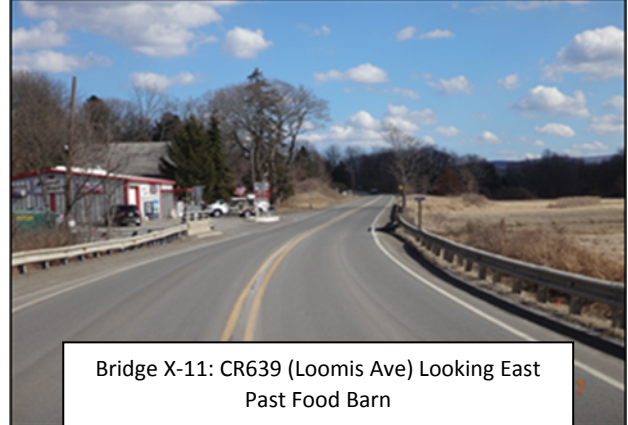
Bridge X-11: CR639 (Loomis Ave) Looking East Past Food Barn