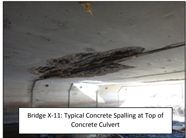
Bridge X-11: Typical Concrete Spalling at Top of Concrete Culvert