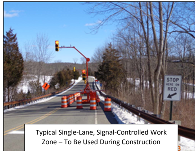
Typical Single-Lane, Signal-Controlled Work Zone – To Be Used During Construction