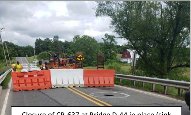
Closure of CR-637 at Bridge D-44 in place (sink hole in foreground)