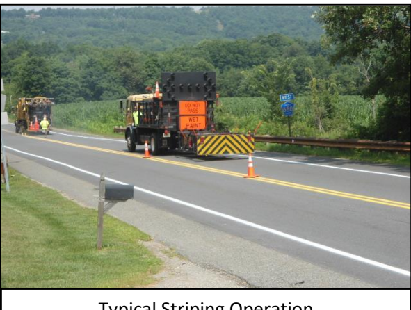
Typical Striping Operation