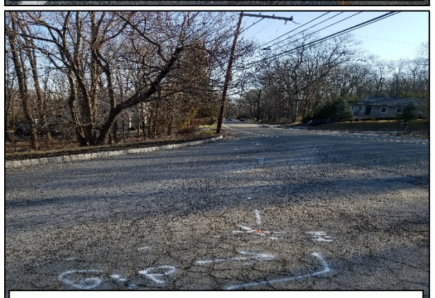
CR 605/Green Apple Rd.: View of Project Site Looking North