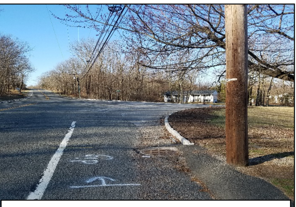
CR 605/Green Apple Rd.: View of Project Site Looking South

For more information about this project please feel free to contact Josh Roe, Engineer Trainee, of the Sussex County Division of Engineering at 973-579-0430 or dpw@sussex.nj.us