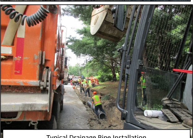
Typical Drainage Pipe Installation