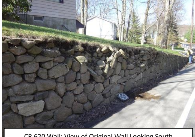
CR 620 Wall: View of Original Wall Looking South

For more information about this project please feel free to contact Josh Roe, Engineer Trainee, of the Sussex County Division of Engineering at 973-579-0430 or dpw@sussex.nj.us