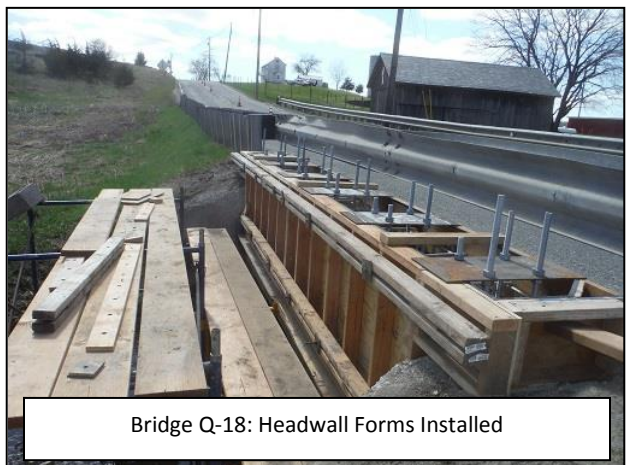
Bridge Q-18: Headwall Forms Installed