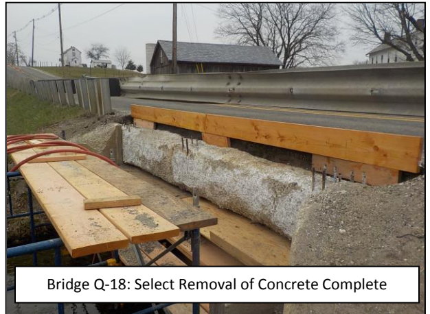
Bridge Q-18: Select Removal of Concrete Complete