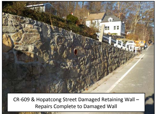
CR-609 & Hopatcong Street Damaged Retaining Wall – Repairs Complete to Damaged Wall