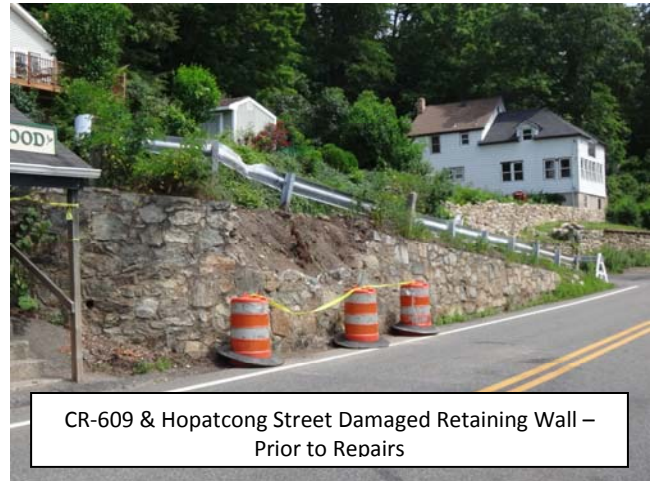
CR-609 & Hopatcong Street Damaged Retaining Wall – Prior to Repairs