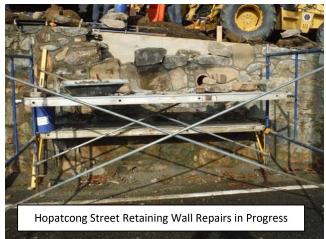
Hopatcong Street Retaining Wall Repairs in Progress