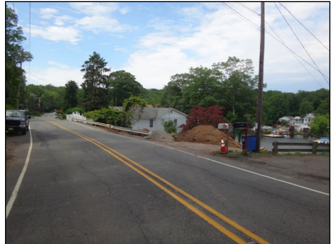
CR-607: Looking NB (toward Hopatcong Firehouse / Indian-Mohawk Trail) in the Vicinity of 345 Maxim Drive