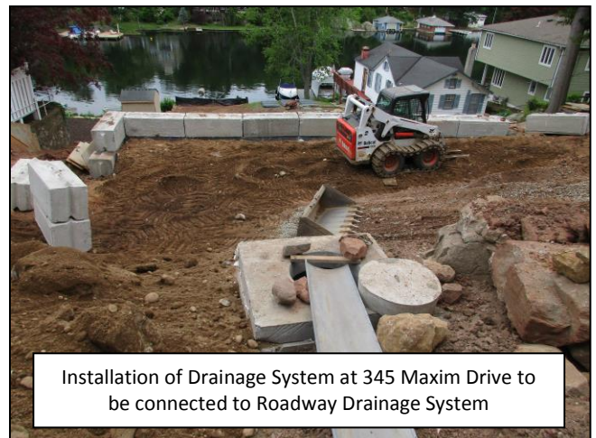
Installation of Drainage System at 345 Maxim Drive to be connected to Roadway Drainage System