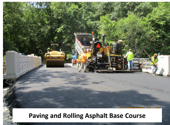
Paving and Rolling Asphalt Base Course