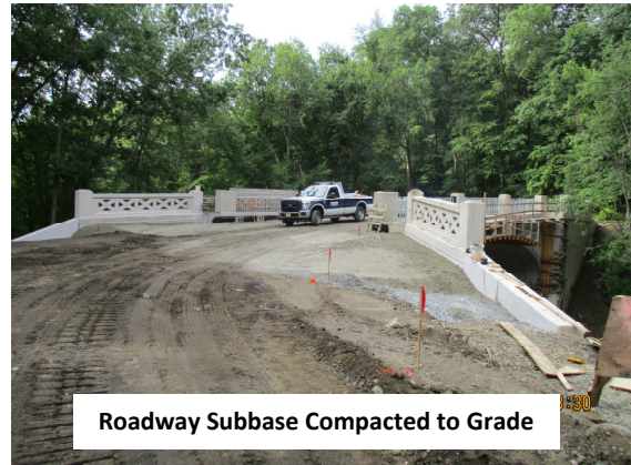
Roadway Subbase Compacted to Grade