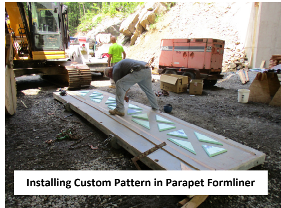
Installing Custom Pattern in Parapet Formliner