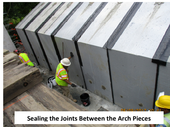
Sealing the Joints Between the Arch Pieces