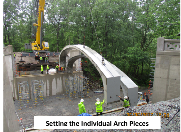
Setting the Individual Arch Pieces