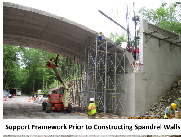
Support Framework Prior to Constructing Spandrel Walls