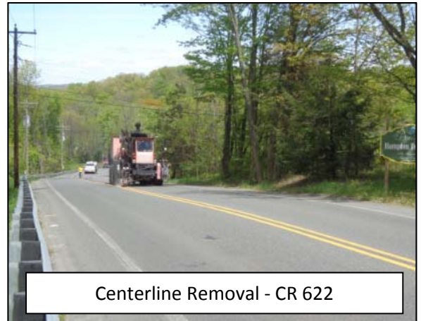
Centerline Removal - CR 622