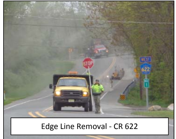
Edge Line Removal - CR 622