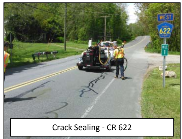
Crack Sealing - CR 622