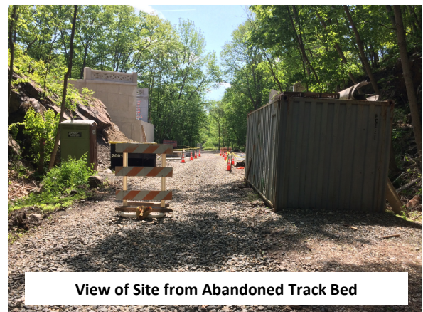
View of Site from Abandoned Track Bed