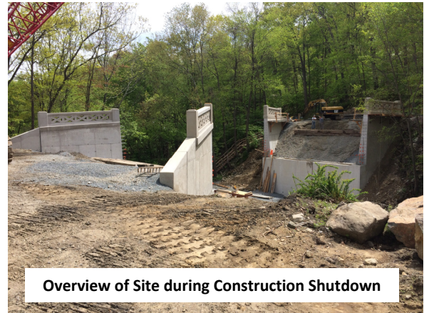
Overview of Site during Construction Shutdown