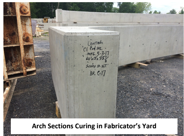
Arch Sections Curing in Fabricator's Yard