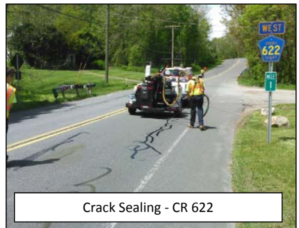
Crack Sealing - CR 622