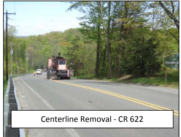
Centerline Removal - CR 622