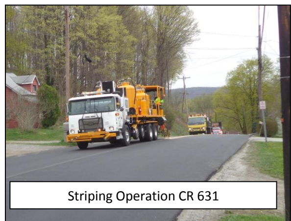
Striping Operation CR 631