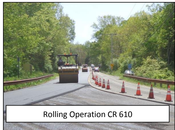
Rolling Operation CR 610