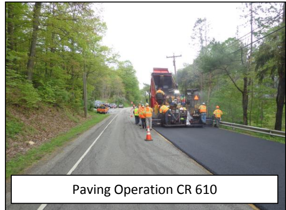
Paving Operation CR 610