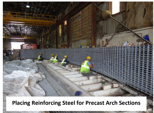
Placing Reinforcing Steel for Precast Arch Sections