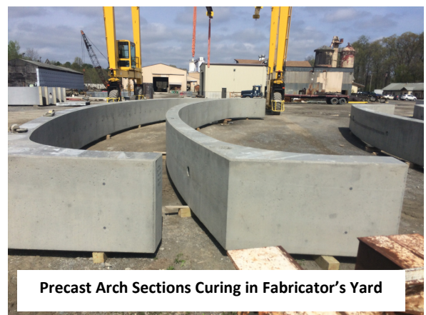
Precast Arch Sections Curing in Fabricator's Yard