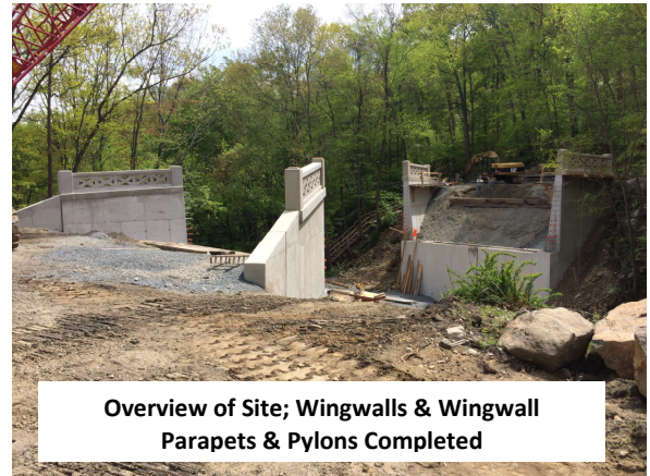
Overview of Site; Wingwalls & Wingwall Parapets & Pylons Completed