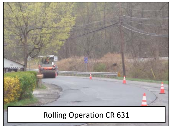
Rolling Operation CR 631