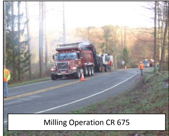
Milling Operation CR 675