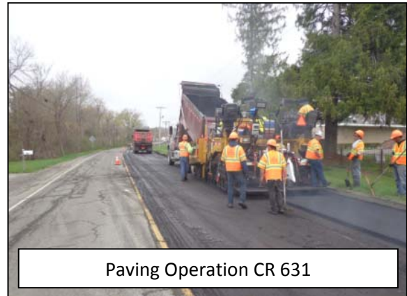
Paving Operation CR 631