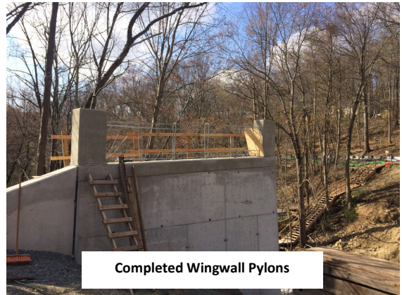
Completed Wingwall Pylons