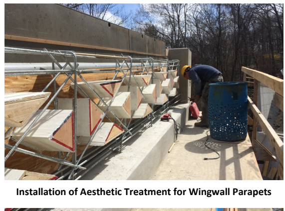
Installation of Aesthetic Treatment for Wingwall Parapets