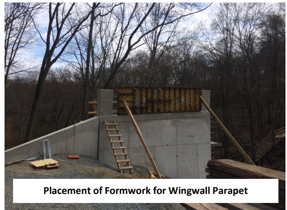
Placement of Formwork for Wingwall Parapet