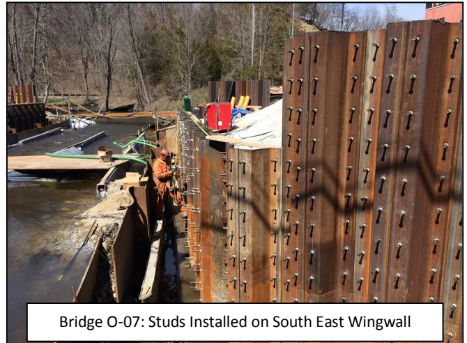
Bridge O-07: Studs Installed on South East Wingwall