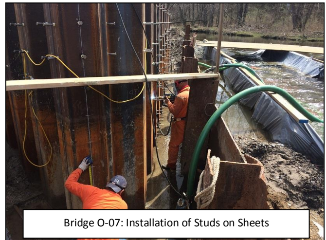
Bridge O-07: Installation of Studs on Sheets