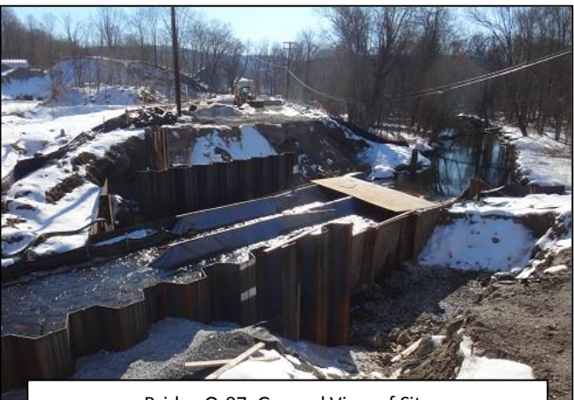
Bridge O-07: General View of Site