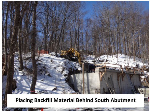
Placing Backfill Material Behind South Abutment