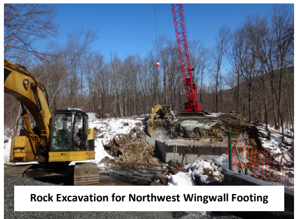
Rock Excavation for Northwest Wingwall Footing