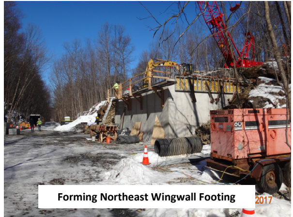
Forming Northeast Wingwall Footing 2017