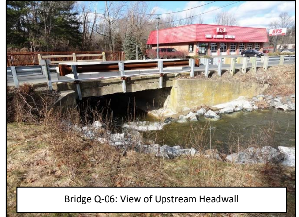
Bridge Q-06: View of Upstream Headwall