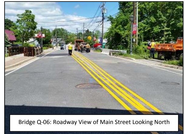
Bridge Q-06: Roadway View of Main Street Looking North