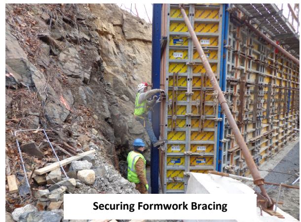
Securing Formwork Bracing