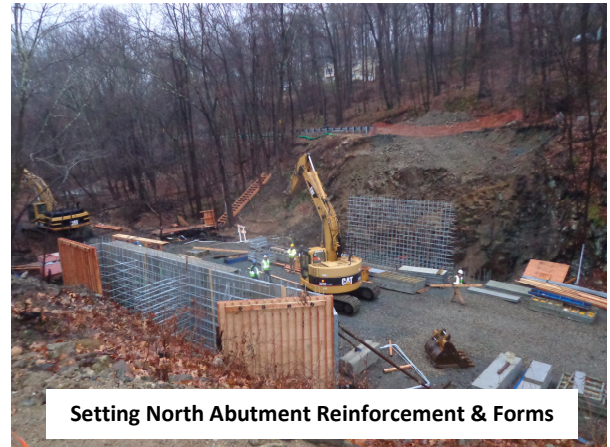
Setting North Abutment Reinforcement & Forms