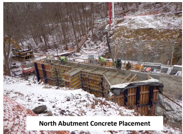
North Abutment Concrete Placement