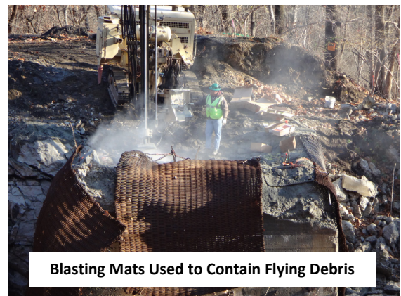
Blasting Mats Used to Contain Flying Debris