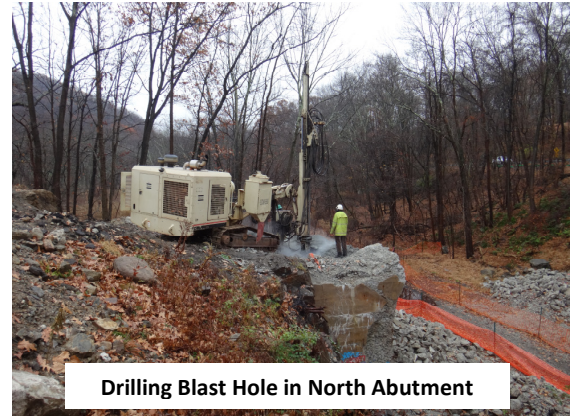
Drilling Blast Hole in North Abutment