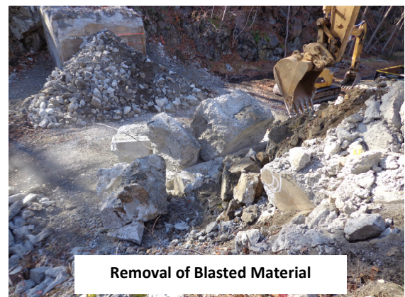
Removal of Blasted Material