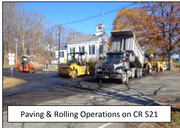
Paving & Rolling Operations on CR 521