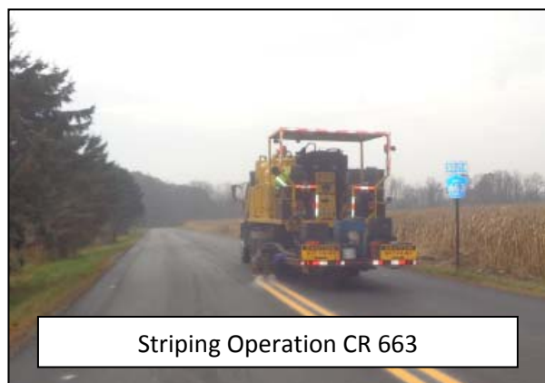
Striping Operation CR 663