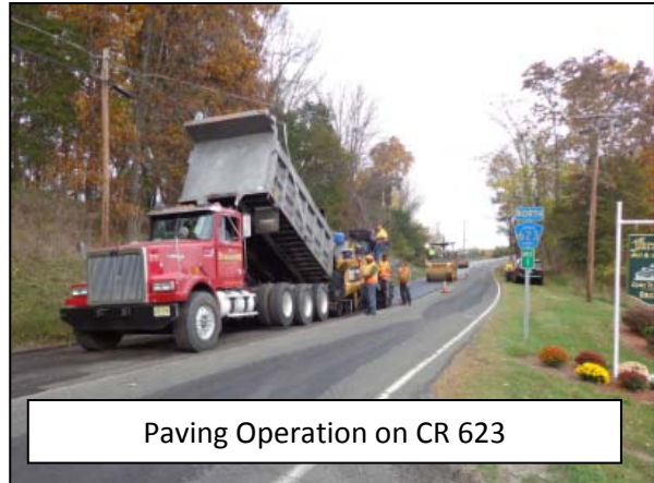
Paving Operation on CR 623