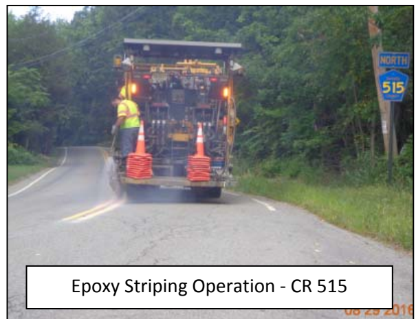
Epoxy Striping Operation - CR 515