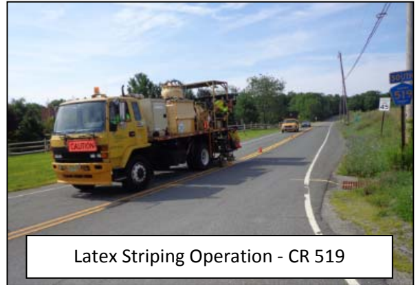
Latex Striping Operation - CR 519