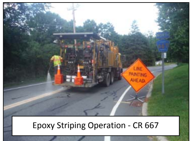
Epoxy Striping Operation - CR 667