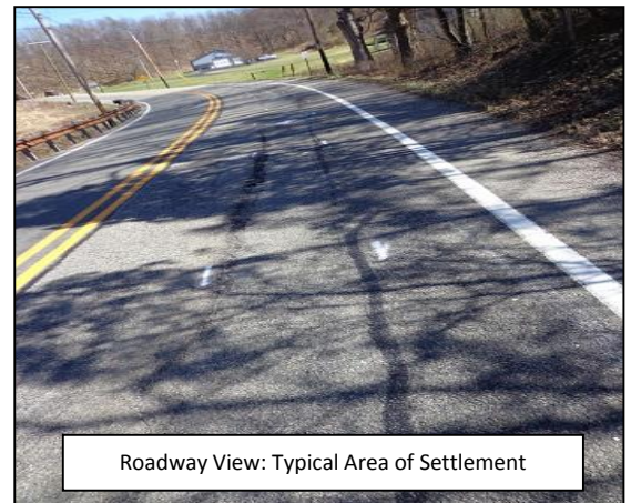
Roadway View: Typical Area of Settlement