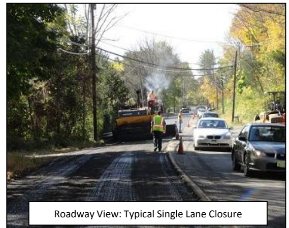
Roadway View: Typical Single Lane Closure