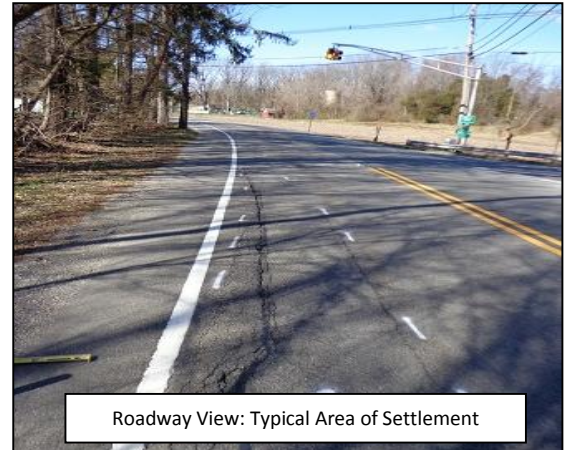
Roadway View: Typical Area of Settlement