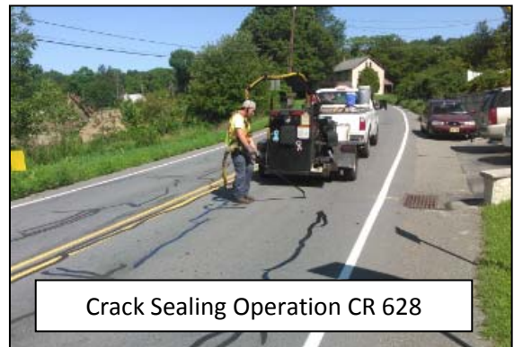
Crack Sealing Operation CR 628