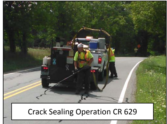
Crack Sealing Operation CR 629