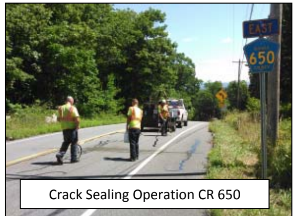
Crack Sealing Operation CR 650