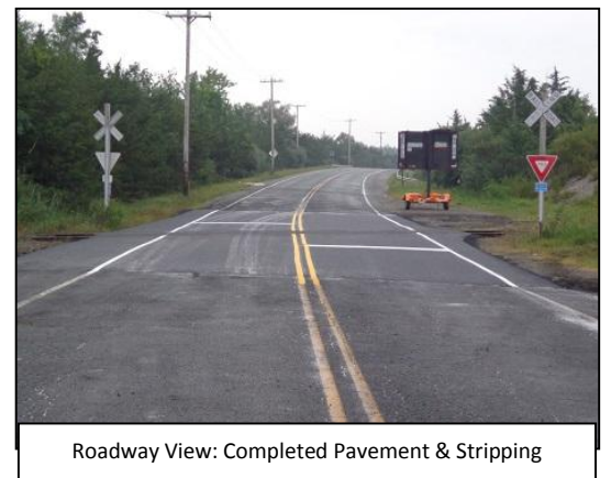
Roadway View: Completed Pavement & Stripping