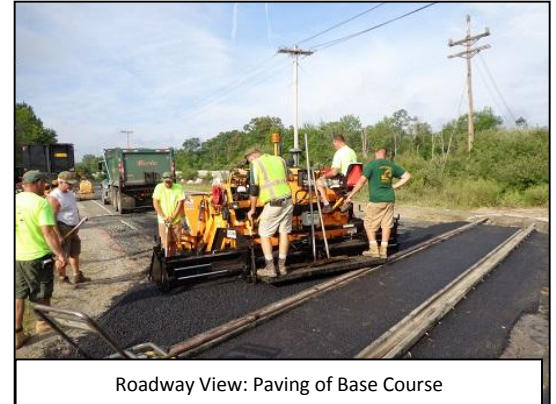
Roadway View: Paving of Base Course