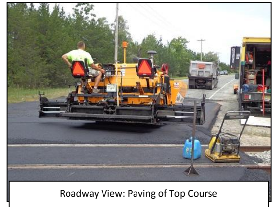
Roadway View: Paving of Top Course