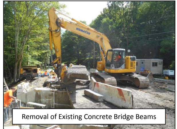
Removal of Existing Concrete Bridge Beams