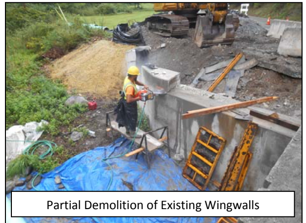
Partial Demolition of Existing Wingwalls