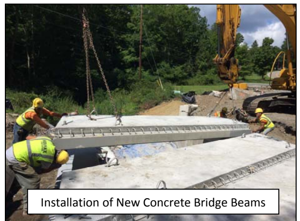
Installation of New Concrete Bridge Beams