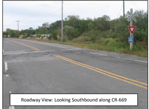
Roadway View: Looking Southbound along CR-669