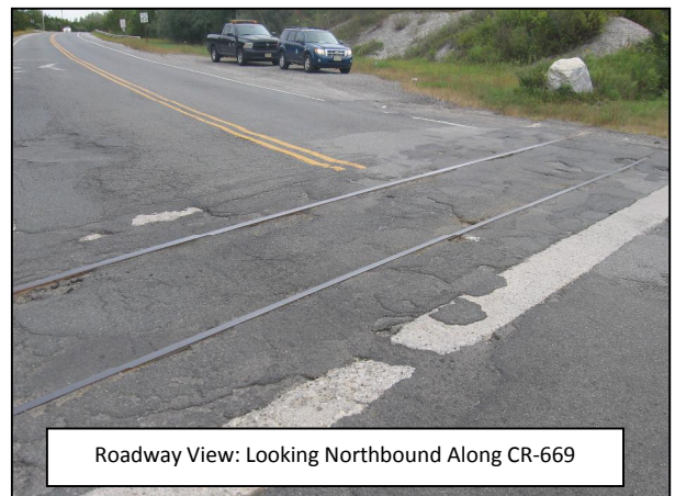
Roadway View: Looking Northbound Along CR-669