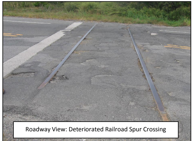
Roadway View: Deteriorated Railroad Spur Crossing