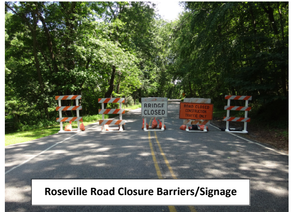
Roseville Road Closure Barriers/Signage