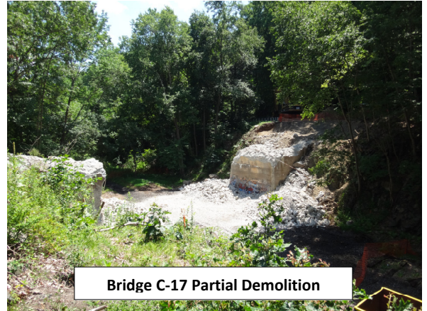
Bridge C-17 Partial Demolition