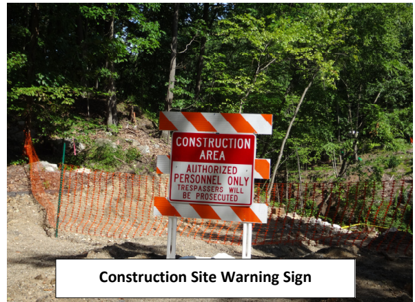
Construction Site Warning Sign