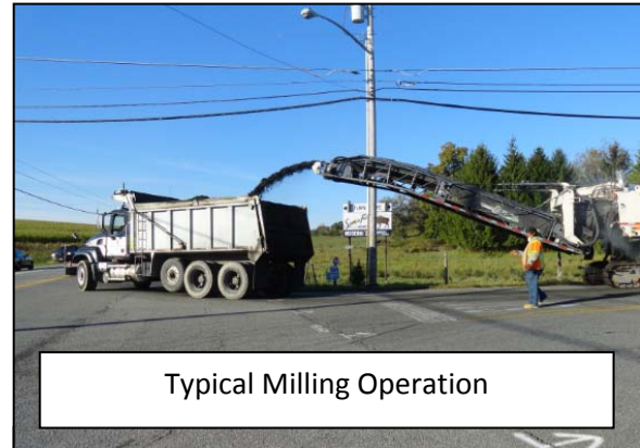
Typical Milling Operation