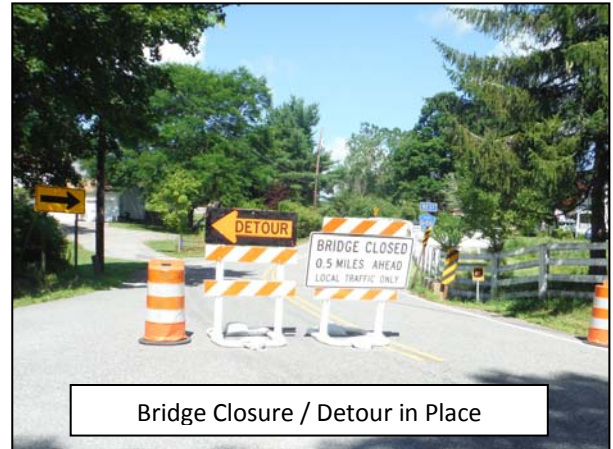
Bridge Closure / Detour in Place