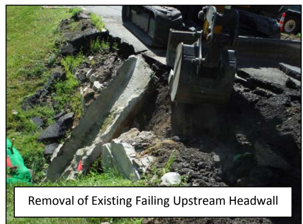
Removal of Existing Failing Upstream Headwall