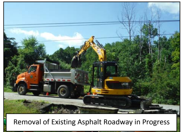
Removal of Existing Asphalt Roadway in Progress