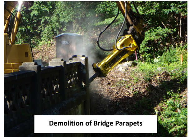
Demolition of Bridge Parapets