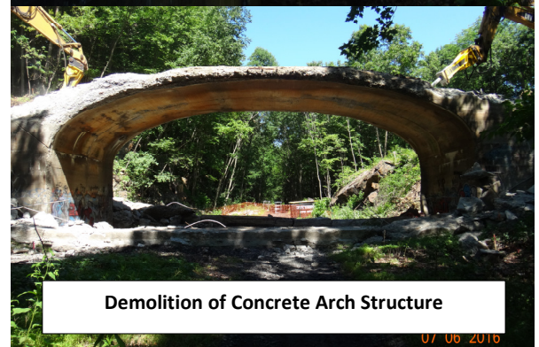
Demolition of Concrete Arch Structure