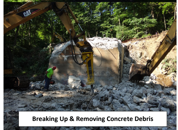
Breaking Up & Removing Concrete Debris