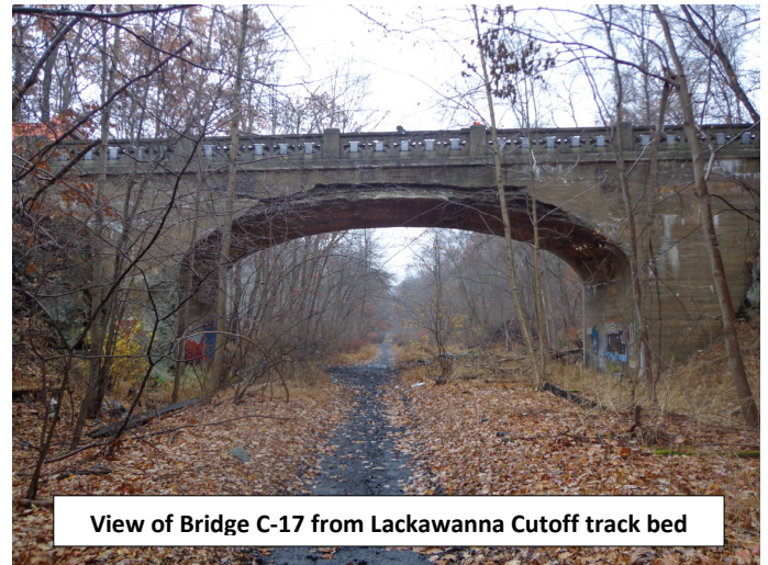
View of Bridge C-17 from Lackawanna Cutoff track bed