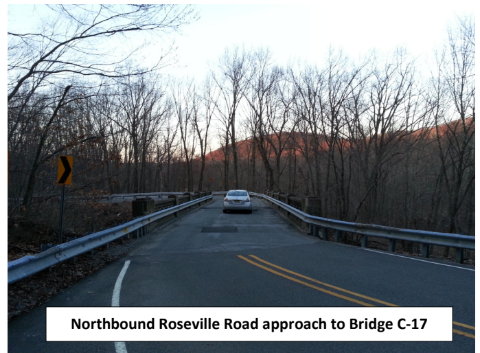
Northbound Roseville Road approach to Bridge C-17