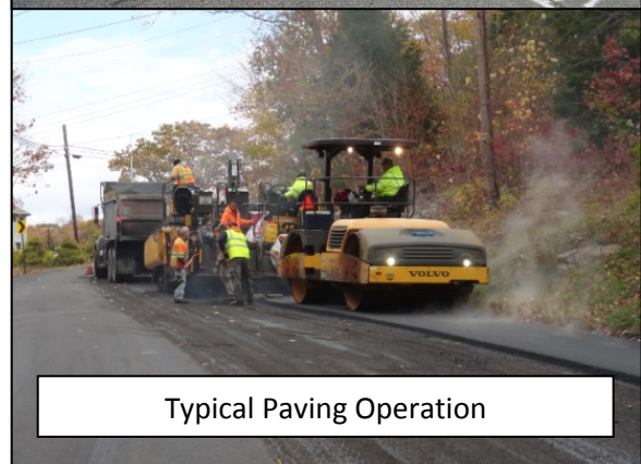
Typical Paving Operation