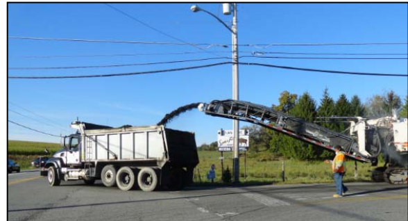
Typical Milling Operation