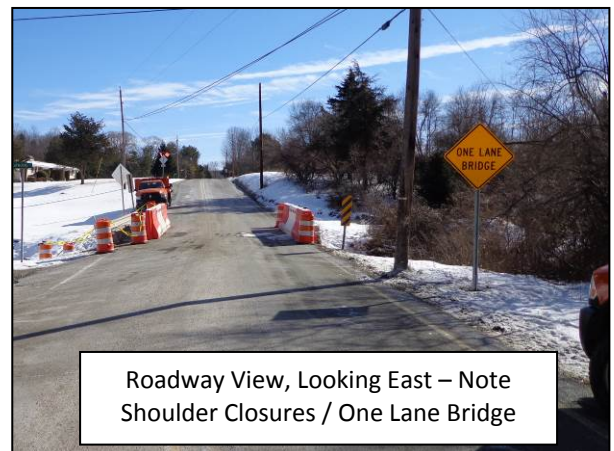
Roadway View, Looking East – Note Shoulder Closures / One Lane Bridge