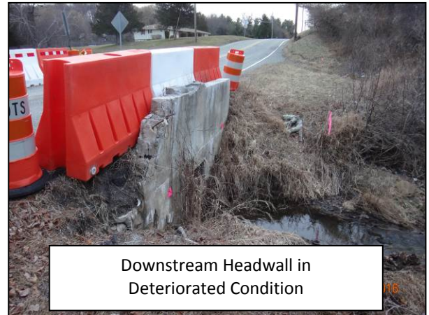
Downstream Headwall in Deteriorated Condition