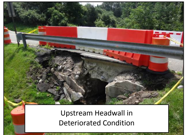
Upstream Headwall in Deteriorated Condition