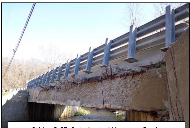
Bridge O-07: Deteriorated Upstream Fascia

Bridge O-07: View of Bridge from Downstream