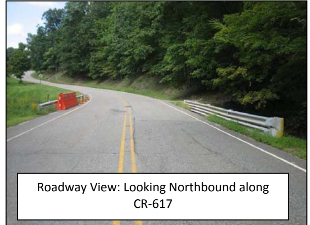
Roadway View: Looking Northbound along CR-617