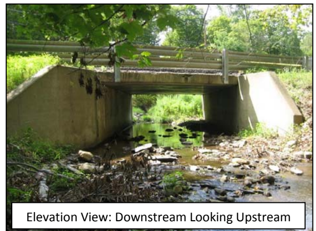
Elevation View: Downstream Looking Upstream