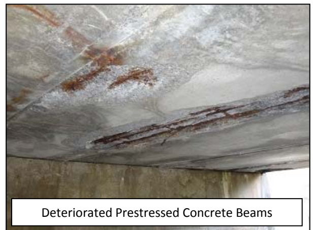
Deteriorated Prestressed Concrete Beams