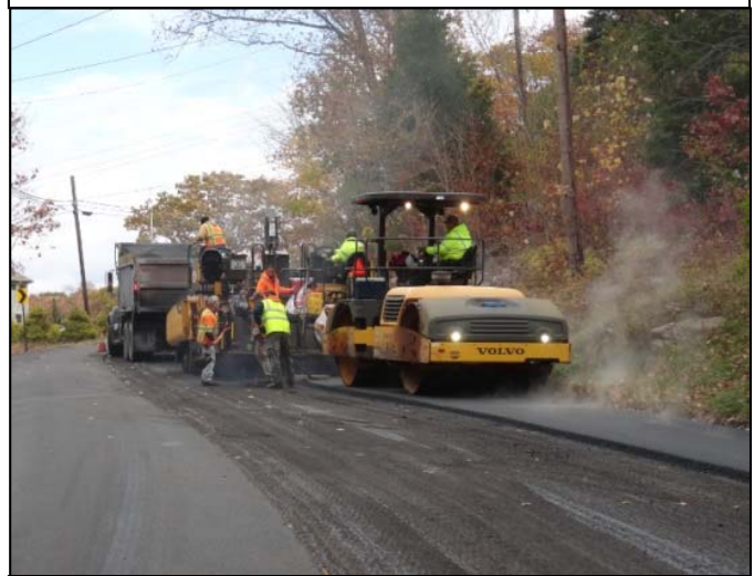
Typical Paving Operation