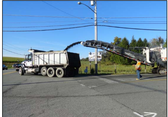
Typical Milling Operation