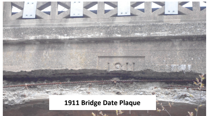
1911 Bridge Date Plaque

Construction will require a full closure of Roseville Road at Bridge C-17, with a signed detour.