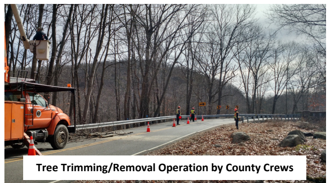
Tree Trimming/Removal Operation by County Crews