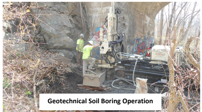
Geotechnical Soil Boring Operation