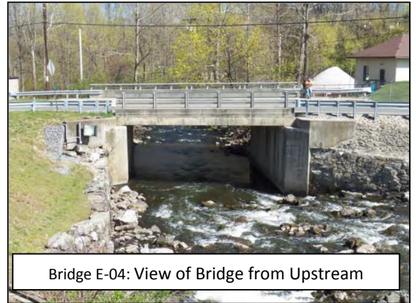
Bridge E-04: View of Bridge from Upstream

For more information about this bridge please contact Siân Pearson, Senior Engineer at 973-579-0430 or dpw@sussex.nj.us .