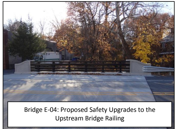
Bridge E-04: Proposed Safety Upgrades to the Upstream Bridge Railing