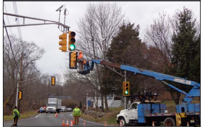
Signal Backplate Installation – CR 519/Halsey Rd