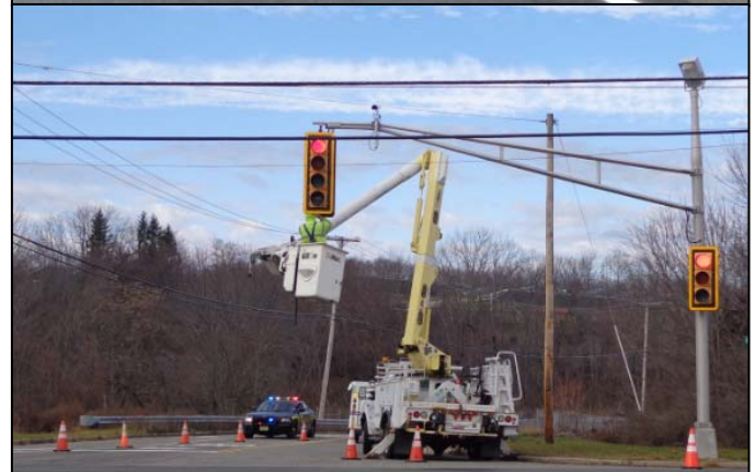
Signal Backplate Installation – CR 519/Plotts Rd