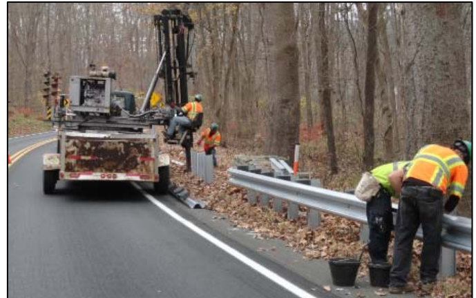
Guide Rail Upgrades – CR 560