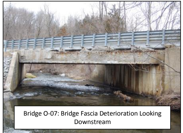
Bridge O-07: Bridge Fascia Deterioration Looking Downstream

Construction will require a full closure of Passaic Avenue at Bridge O-07, with a posted detour.