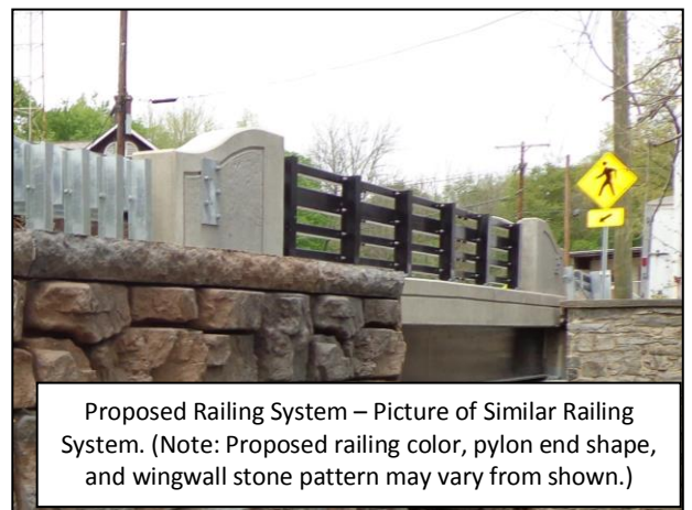
Proposed Railing System – Picture of Similar Railing System. (Note: Proposed railing color, pylon end shape, and wingwall stone pattern may vary from shown.)

For more information about this project please feel free to contact Siân Pearson, at the Sussex County Division of Engineering at 973-579-0430 or dpw@sussex.nj.us