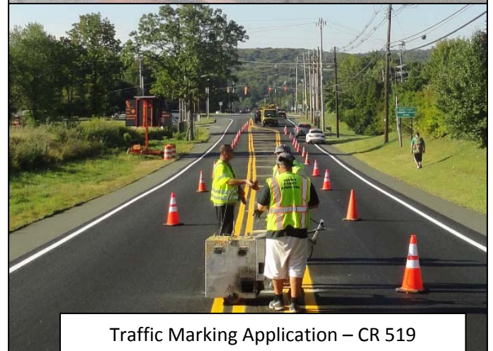
Traffic Marking Application – CR 519