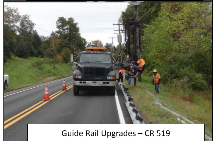
Guide Rail Upgrades – CR 519