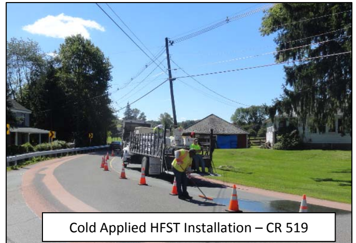
Cold Applied HFST Installation – CR 519