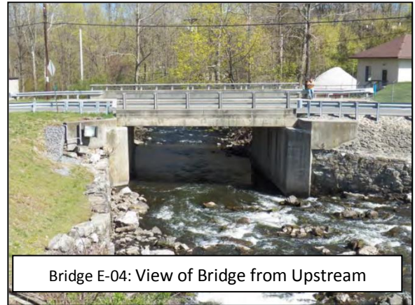
Bridge E-04: View of Bridge from Upstream

The recent posting of a 12 ton weight restriction on this 105 year bridge appears to be causing significant alteration of existing traffic patterns for large trucks which can no longer legally cross Bridge E-04. In the interest of public safety, the Sussex County Board of Chosen Freeholders has directed its Division of Engineering to expedite the necessary design & construction work to re-open Bridge E-04 to all legal loads.