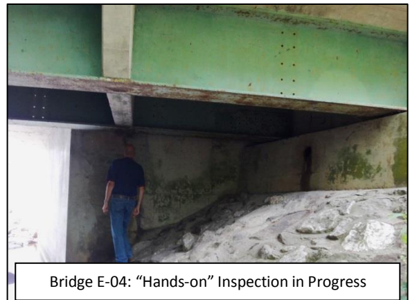
Bridge E-04: “Hands-on” Inspection in Progress