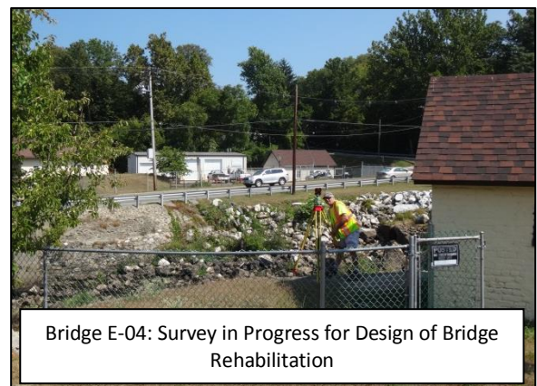
Bridge E-04: Survey in Progress for Design of Bridge Rehabilitation