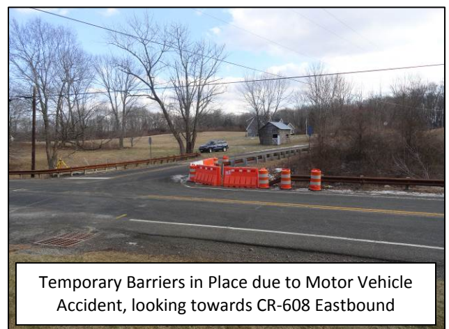
Temporary Barriers in Place due to Motor Vehicle Accident, looking towards CR-608 Eastbound