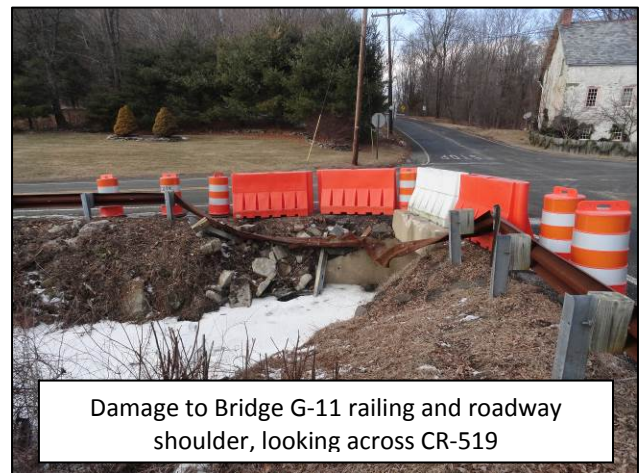
Damage to Bridge G-11 railing and roadway shoulder, looking across CR-519