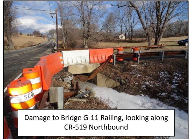
Damage to Bridge G-11 Railing, looking along CR-519 Northbound