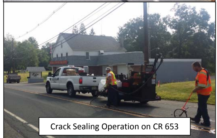
Crack Sealing Operation on CR 653