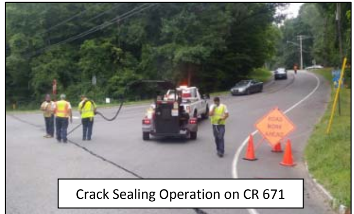
Crack Sealing Operation on CR 671