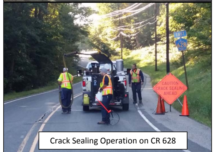
Crack Sealing Operation on CR 628